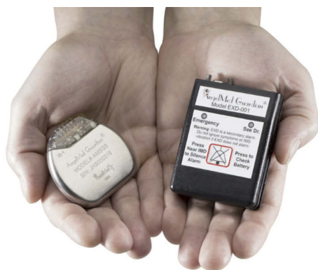
Figure 2 Implantable medical device (IMD) and external medical device (EXD).