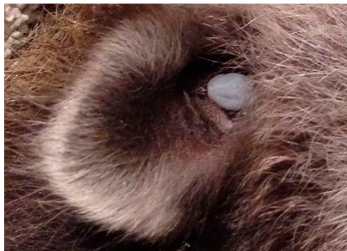
Figure 6. Engorged Ixodes female parasitizing a medium-sized mammal inside its ear. Ticks select secluded areas of the body to prevent dislodgement during grooming and preening by front paws or incisors.

Terrestrial mammals provide short-distance dispersal of ticks, and maintain the enzootic transmission cycle of Bbsl within a Lyme disease endemic area. Ticks have an innate ability to avoid premature dislodgement from their hosts. They select secluded attachment sites (e.g., inside ear lobe) that are not subject to grooming or preening (Figure 6). In order to thwart tick dislodgement, ticks will attach beyond the reach of the incisors and the front paws or toes.