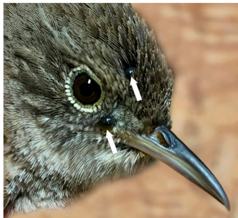
Figure 3. House Wren parasitized by Ixodes scapularis nymphs. While ground-dwelling passerines are foraging for morsels on the forest floor or meadow, they can be parasitized by bird-feeding ticks.

Of special significance, we present the first documentation of a potentially unique Bbsl strain in Canada. This de novo Bbsl strain (GenBank accession number MH290738) was detected in an I. muris larva that was collected from a House Wren (Table 3), and is the first account of this Bbsl strain in this tick species in Canada (Figure 3). Using a portion of the flaB gene, this Bbsl strain is a 100% match to a Wisconsin strain W97F51 obtained in 1997 [55]. Moreover, the flaB fragment sequence is ~99% identical to Borrelia lanei reference strains. This de novo Bbsl strain may possibly represent a distinct and different Bbsl genospecies. Thus, we are simply calling this novel strain B. burgdorferi sensu lato. Moreover, since this I. muris larva was collected during southbound fall migration, this bird parasitism suggests that this unique Bbsl strain may be established in Canada.