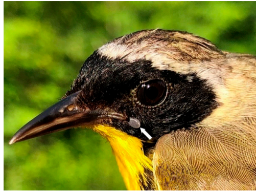
Figure 4. Common Yellowthroat, adult male, parasitized by nymphal Ixodes scapularis ticks. Since these nymphs were collected during the nesting and fledgling period, this bird parasitism indicates that this location has an established tick population.

transmitted to these attached larvae. Since these juvenile birds have just fledged the nest, and had scant exposure to ticks, it is possible that the mother birds were spirochetemic, and may have transmitted Bbsl to their offspring. In addition, two I. muris nymphs were collected from a juvenile Common Yellowthroat during southward fall migration, and one of these co-feeding nymphs tested positive for Bbsl (Figure 4). Of epidemiological significance, I. muris is a Lyme disease vector tick that has vector competence for Bbsl, and can transmit Lyme spirochetes to humans [22].