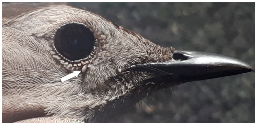
Figure 2. Gray Catbird parasitized by an I. scapularis nymph at Site 5. This nymph was infected with Babesia odocoilei . The white arrow points to the location of an engorged tick (the same below).

Two single I. scapularis nymphs were collected from two individual Gray Catbirds at Site 5 on 24 May 2018. Each of these nymphs was infected with B. odocoilei piroplasms (Figure 2).