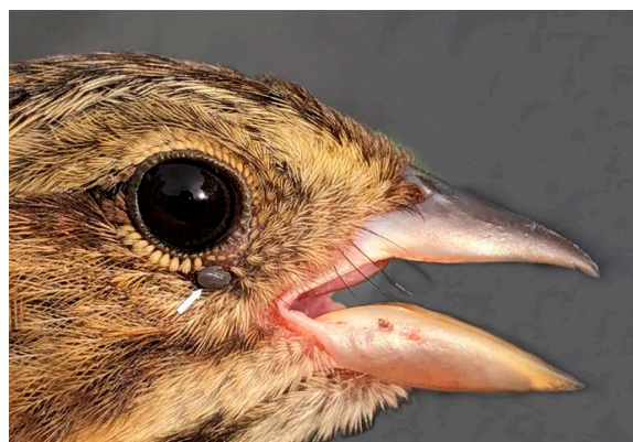
Figure 5. Song Sparrow, a juvenile, parasitized by three Ixodes scapularis nymphs (two are not visible). Since these ticks were acquired in close proximity to the nest, this bird parasitism indicates that an established population of I. scapularis is present within this nesting area.

During the nesting and fledgling period, ground-foraging passerines are short-distance disseminators of locally acquired ticks. In particular, juvenile (hatch-year) songbirds, which fly south for the winter, have not yet migrated. During this early summer period, a heavily infested juvenile songbird clearly shows that there is an established population of ticks within the nesting area (Figure 5).