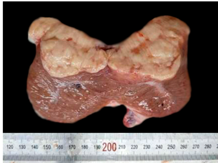
Figure 1. Cross section of the testicular tumor isolated from a black bear showing yellow, tan, and lobulated neoplasm, which is isolated from a nearby tissue by a fibrous capsule.

Gross description of the lesion was followed by routine processing, hematoxylin and eosin (H&E) staining of 5- \mu m thick sections. Markers including ER- \alpha , ER- \beta , inhibin- \alpha , cytokeratin 19, S-100, and vimentin immunoglobulins were used to determine the type of tumor. Gross examination of the tumor showed a firm, lobulated, yellow tan, and well-circumscribed mass embedded inside testicular tissue (Figure 1). Section of the tumor revealed that the neoplasm had soft necrotic areas with hemorrhage beneath the capsule.