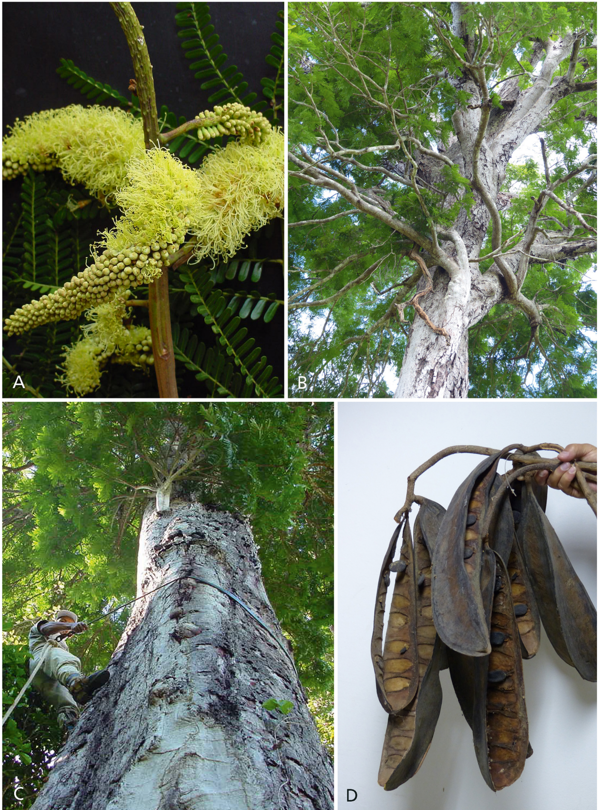
Fig. 2. Dinizia jueirana-facao . A part of a compound inflorescence; B part of crown of type specimen; C trunk of type specimen; D dehisced fruits.