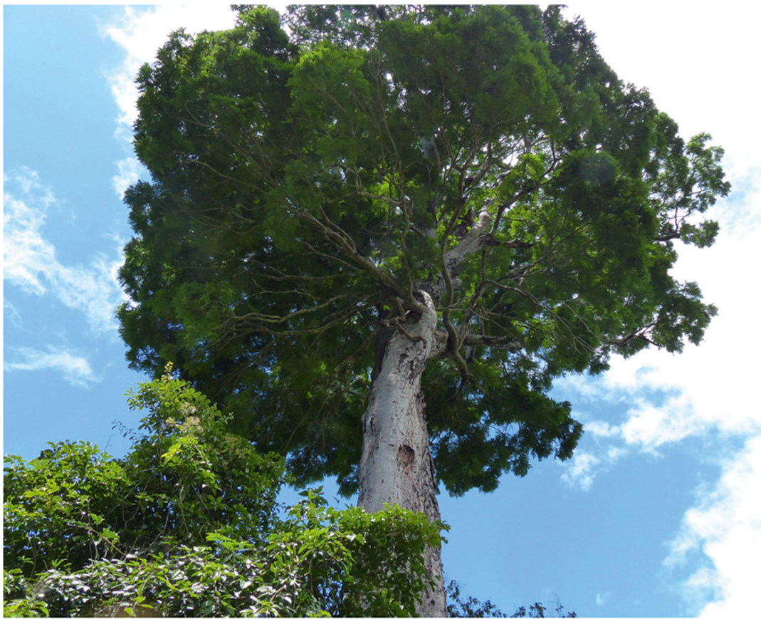
Fig. 4. Dinizia jueirana-facao , type specimen.

Jueirana is thought to be derived from the Tupi word yuá-rana . Yuá (or Juá ) is a Tupi common name for several different plant species, especially those in the Solanaceae with round, spiny fruits (Andrade 2006; Sampaio 1987). Rana in Tupi means similar to, so yuá-rana or jueirana means false juá (or similar to juá ), although there is little resemblance between the new legume species and any Solanaceae. A number of place names in Brazil are derived from jueirana or an orthographic variant of this.