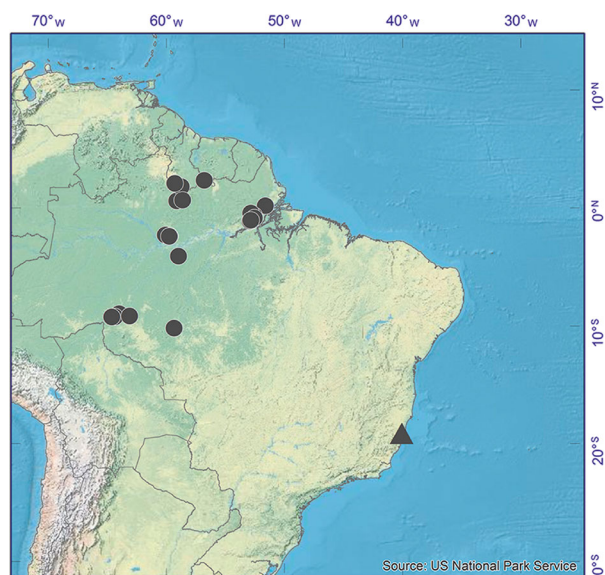
Map 1. Distribution of Dinizia excelsa (black circles) and D. jueirana-facao (black triangle) in Brazil and the Guianas.