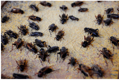
Fig. 1 Gryllus bimaculatus farmed in Khon Kaen Province, Thailand

agricultural process through to consumption in the home or restaurants and waste disposal. LCA is just one among several different environmental impact assessment methods; however, it is recognized as the most complete, it is used for the majority of food products and supply chains, and it has been adopted as the methodological base for environmental declaration schemes (Notarnicola et al. 2015).