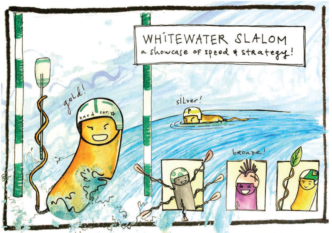
Figure 1 |. Whitewater winner. Gold medallist, Vibrio coralliilyticus , flicks into first, overcoming a strategically diverse field of white-water slalom contenders.