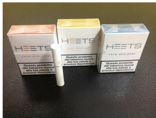
Fig. 3. The Heets of the study (to be inserted).