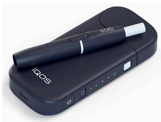
Fig. 2. The IQOS devices (to be inserted).