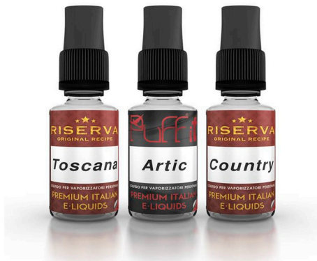
Fig. 5. The e-liquids of the study (to be inserted).

a popular e-cigarette blog. Experts convened in Verona (Italy) during a major vaping expo event. Through consensus, the expert panel provided specific recommendation on the device (JustFog Q16 Starter Kit is one of the most popular e-cigarette device in Italy due to its good performance and quality, affordable price, and user friendliness especially for beginners) and the choice of e-liquids that could best match the sensorial experience of the IQOS tobacco sticks to be used in a switching study and minimize the local irritant effects of excessive PG/VG (propylene glycol vegetable glycerin) ratio. these products are compliant to the eu tobacco product directive.