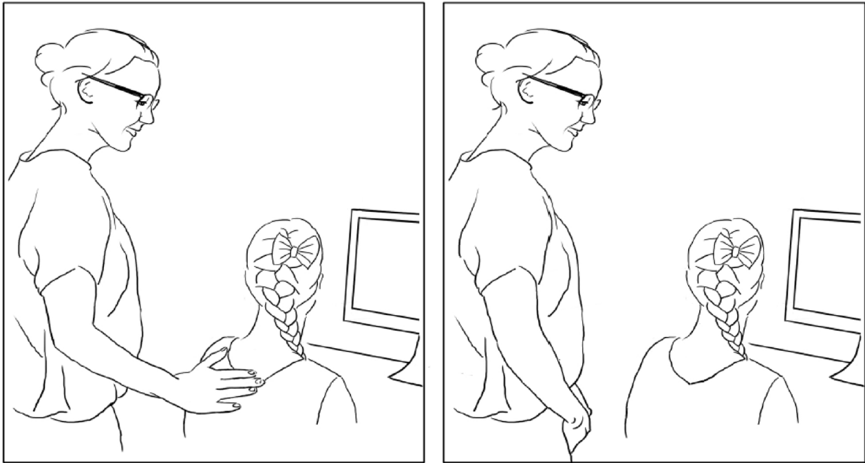
Fig. 1. A depiction of the manipulation of parental touch (left panel: touch condition; right panel: no-touch condition). The only difference between conditions was that, in the touch-condition, the parent placed the palm of their right hand gently on the back of the child's left shoulder, right below the deltoid, for the duration of one second.

appeared for 500 ms, one on the left and one on the right side of the screen. The faces were taken from standardized sets (Ekman and Friesen, 1976; Lundqvist et al., 1998), and were either neutral and angry (40 trials), neutral and happy (40 trials), or both neutral (20 trials, serving as filler trials). An asterisk (i.e., probe) appeared in the location of one of the faces until children responded. On critical trials (i.e., neutral-angry, neutral-happy), the probe appeared in the same location as either the emotional face (congruent trials; 40 trials) or the neutral face (incongruent trials; 40 trials). Children indicated whether the probe appeared on the left or right side of the screen by pressing keys labelled “left” or “right” as quickly and as accurately as possible. Inter-trial interval varied randomly from 750 to 1250 ms.