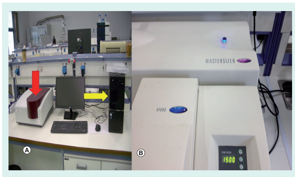
Figure 2. Droplet measurement equipment. (A) Z potential measurement equipment; red arrow indicates the place where the solution is inserted, the yellow arrow indicates the computer-processor. (B) Mastersizer system 2000 (Malvern Instruments Ltd, Worcestershire, UK) for aerosol droplet and dry powder measurement. Adapted with permission from [39] © Ivyspring International Publisher (2018).

tubes, so the rule would not apply, but cisplatin has to be absorbed in the alveoli so particles must be \leq 5 \mu\text{m} . The electrophysical properties (Z potential) is the most important factor in larger airway branches since the drug interacts with the local transporters and local drug absorption is mostly done with this interaction (Figure 2).