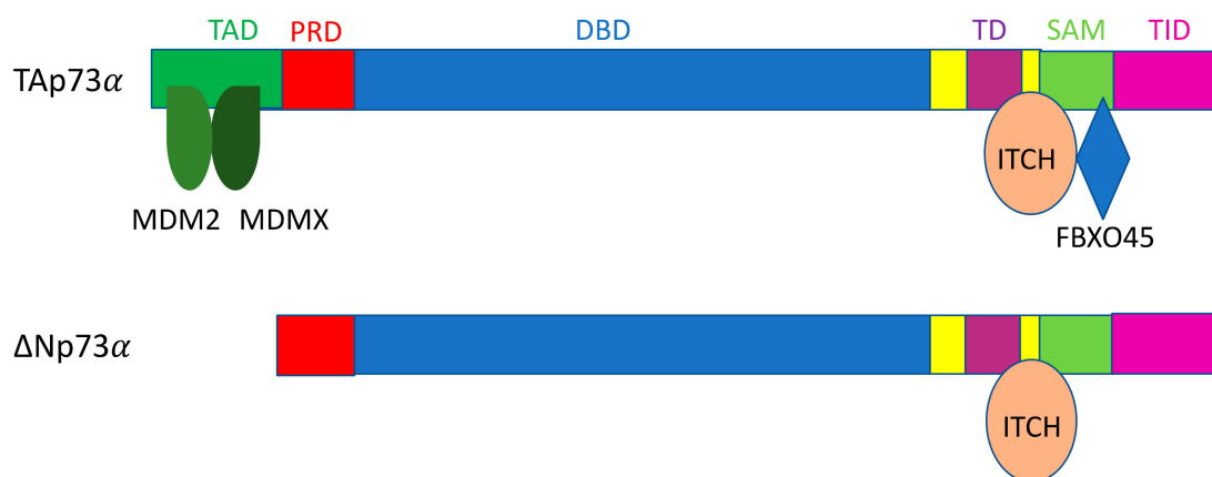
Figure 3. Schematic representation of interaction of p73 with different E3 ligases.