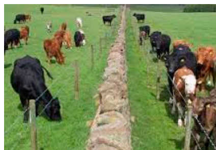
Figure 2. BLV positive and negative cattle separated by two fences.