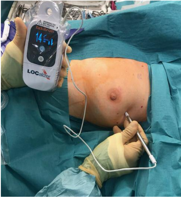
Figure 1. Faxitron LOCALIZER™ handheld reader device being used intra-operatively to locate the RFID tag implanted at the tumour site prior to surgery. RFID: Radio-frequency identification.

well-versed in this technique and it is relatively affordable. However, the procedure's pitfalls are well-known: i) inflexible scheduling coupled with the surgery, ii) wire displacement, iii) wire fragmentation, iv) wire migration, v) patient discomfort and anxiety, vi) injury of other organs, vii) the risk of needle-stick injuries and viii) issues with cosmesis owing to the wire-placement procedure that dictates incision (14).