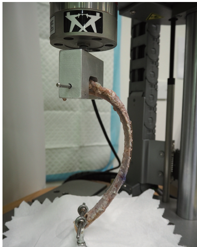
Figure 3 Following plate fixation, the specimen was subjected to cyclical loading for 50,000 cycles at a load of between 2 to 3 Newton.

As shown in Table 1 , the mean native stiffness for left-