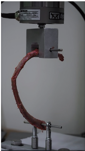
Figure 1 Experimental setup using the Instron E-1000 Dynamic Tester. The rib was statically loaded to failure to induce a clinically realistic fracture pattern.

In 2002, Tanaka et al. randomized 37 patients with flail chest who required mechanical ventilation into two treatment groups: conservative versus surgical fixation. He reported that the group that was treated surgically had a significantly shorter duration on ventilator, shorter duration in intensive care, lower incidence of pneumonia, and improved pulmonary function (2). Several smaller case series also reported reduced mortality, better pain control, better clearance of secretions, and quicker back to work time (3-5).