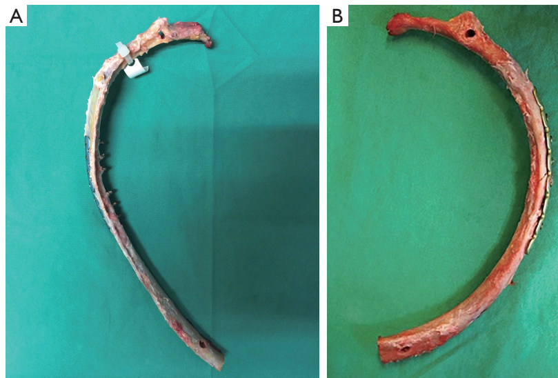
Figure 2 Bicortical and monocortical plate fixation of the rib using the Synthes MatrixRIB plating system. (A) In bicortical fixation, the screw tip traverses both the inner and outer cortices of the rib; (B) the screw tip does not traverse the inner cortex of the rib in monocortical fixation.

biomechanical studies for rib fractures (6,9). The tests comprised of 4 phases: