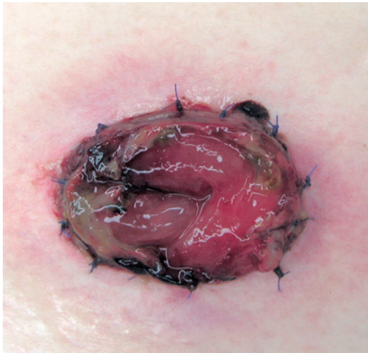
Figure 1. Stoma necrosis above the fascia.

for revision[4,10,11]. If the necrosis extends above the fascia (Figure 1), an immediate revision may not be necessary. However, if the length of necrosis is more than 1 or 2 cm, early revision is recommended to prevent future stenosis[10]. If the necrosis extends below the fascia (Figure 2), an immediate surgery is required with resection of the ischemic bowel and refashioning of the new stoma[4,10,11,16,17].