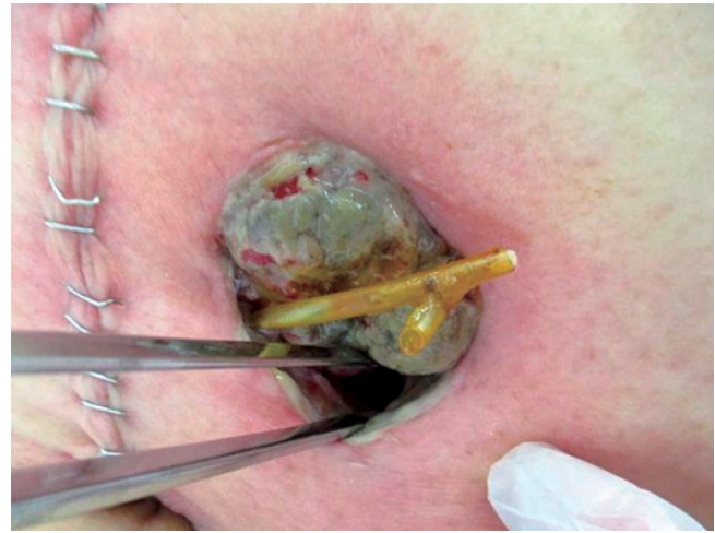
Figure 2. Stoma necrosis below the fascia.

Close monitoring of body weight, fluid balance, serum