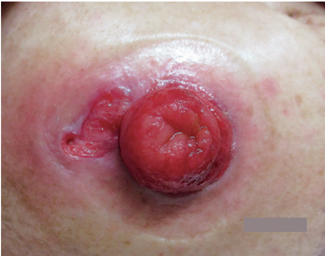
Figure 3. Peristomal pyoderma gangrenosum (PPG) before treatment.