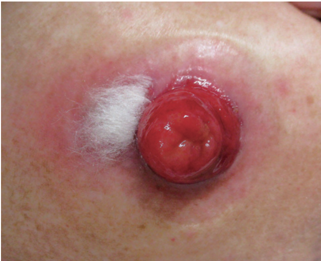
Figure 4. Application of alginate dressings to peristomal pyoderma gangrenosum (PPG).

etiology is unclear, inflammatory bowel diseases, autoimmune diseases, and mechanical trauma are suggested as the underlying pathophysiological factors[58]. The incidence of PPG is 0.9%-4%[58,60,61], and this rarity makes it difficult to define diagnostic and therapeutic approaches. Potential risk factors are female gender, higher body mass index, presence of autoimmune diseases, parastomal hernias, repetitive peristomal stress, irritation from bowel leakage and appliance changes, and tension or ischemia from the ostomy appliance[57,61]. Approximately 70% of the patients reported a concurrent flare of the underlying systemic disease at the time of PPG onset[57]. The reported time of PPG onset after stoma creation varies, while recent studies have reported the mean onset of 23 months[57,58]. Interestingly,