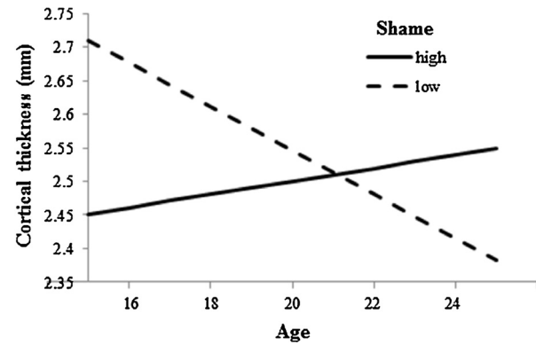
Fig. 3. Association between age and left IOFC thickness for high (+1 SD) and low (−1 SD) levels of shame-proneness.

At an uncorrected level, there was a significant association between higher levels of guilt and thicker right dmPFC ( \beta = 0.33 ,