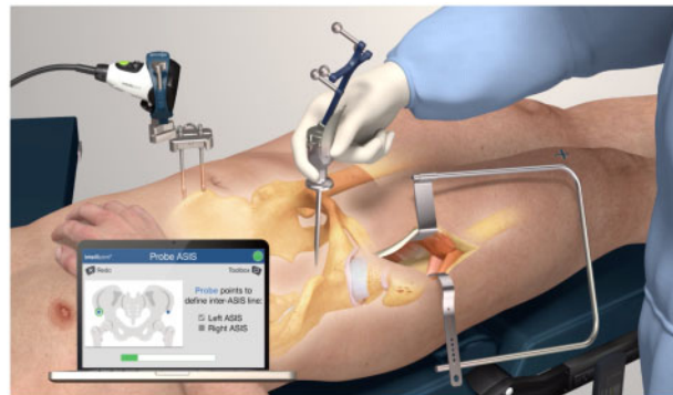
Fig. 1. Animation of intra-operative utilization of the Intellijoint HIP ® 3D mini-optical navigation tool.

In this modified technique utilizing optical navigation, the navigation camera is installed on the contralateral iliac crest. Per the standard procedure for the navigation device, two surgical pins are inserted into the iliac crest through stab incisions. A small magnetic platform is fixed to the surgical pins and provides a mounting point for the camera, which is aimed at the planned incision on the contralateral hip. The patient's initial position is then registered by touching a tracker probe to both anterior superior iliac spines (ASIS) and the pubic symphysis, which establishes the orientation of the anterior pelvic plane (Fig. 1). A non-sterile or sterile electrocardiogram lead may be placed on the symphysis or contralateral ASIS as necessary for precise landmarking. As the device is fixed to the patient during surgery, any patient movement is accounted for by the device and positional data are provided relative to the current position of the patient, not the registration position. Following registration, the camera can be detached from