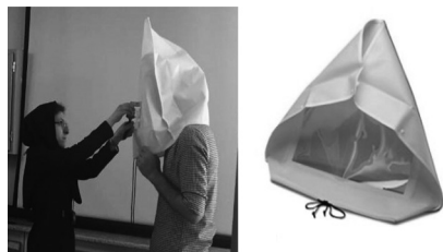
Fig. 1. Moldex fit test hood used in the current study.

slightly open with tongue extended and to report as soon as they could detect the taste (not smell) of the challenge agent, however, we didn't notify the participants about the taste of the solutions (sweet, bitter, etc.). Secondly, the challenge agent was injected in the hood via inserting ten squeezes of the nebulizer bulb into the hole in front of the hood. This requires the bulb to fully collapse and expand during each squeeze cycle. Thirdly, the participants were asked if they could detect the taste of the solution. We applied up to a total of 30 sprays if required. Also, the taste threshold was recorded as ten, twenty, or thirty regardless of the numbers of actual performed squeezes (10, 20 or 30 sprays). In other words, if the participants could taste between 1–10, 11–20, or 21–30 sprays, their threshold levels were classified into one of the three classes of High (1), Medium (2), or Low (3), respectively. If the participants couldn't detect the taste of the solution after 30 sprays, they were not sensitive to it and their threshold test was assigned as a failure; otherwise, a pass. The video of Moldex threshold screening procedure was played for the participants 33 .