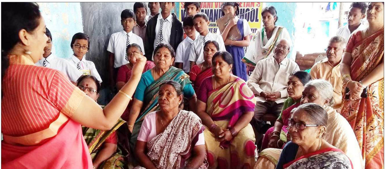
Advocacy for diabetic retinopathy screening