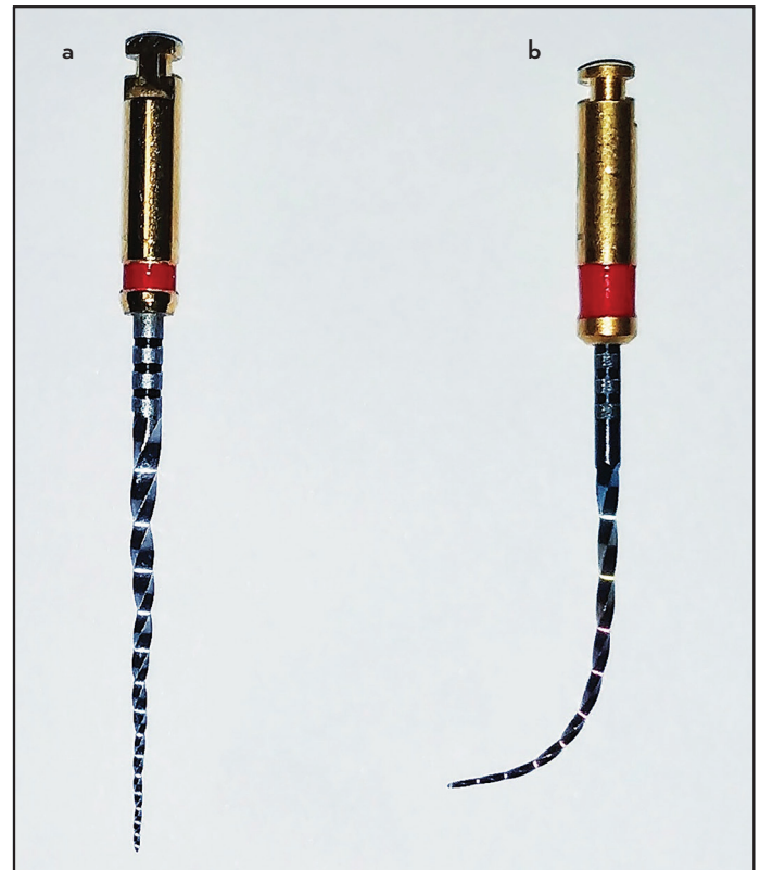
Figure 3. Comparison of austenitic (ProTaper Next) and martensitic NiTi files (CM wire). (a) The austenitic NiTi file cannot be bent at room temperature; (b) The martensitic file can be bent at room temperature

CM wires were introduced in 2010. They have a lower nickel content (52% wt.), as compared to other NiTi files. To incorporate extreme flexibility, these files undergo special thermo-mechanical treatment that also improves the shape memory effect of these files. Consequently, they do not have the rebound effect after unloading, and their original shape is restored after heat application or autoclaving procedure. Clinically, this incurs the benefit of pre-bending this file before placing in a curved canal, especially with patients with limited mouth opening. The CM wire has a stable martensite phase because the austenite finishing temperature is above the working temperature. This implies that thermally processed controlled memory alloys would mostly or totally be in the martensite phase at body temperature (32) (Fig. 3). CM instruments also have increased resistance to cyclic fatigue (300%–800% more fatigue resistant) because of their unique manufacturing process as they do not rebound to their original shape (33). However, they have one major drawback of increased tendency of permanent plastic deformation during use. Due to this weakness, these instruments are recommended for single use only (34). Some commercial brands of CM files include Hyflex CM, Thyphoon Infinite Flex NiTi Files, V-Taper 2H, and Hyflex electrical discharge machining (EDM).