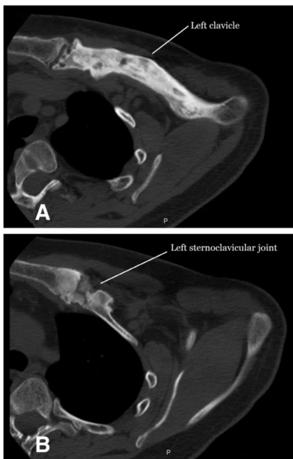
(A) Osteosclerosis and bone expansion of the left clavicle extending to the sternoclavicular joint. (B) Osteitis and hyperostosis of the left sternoclavicular joint.