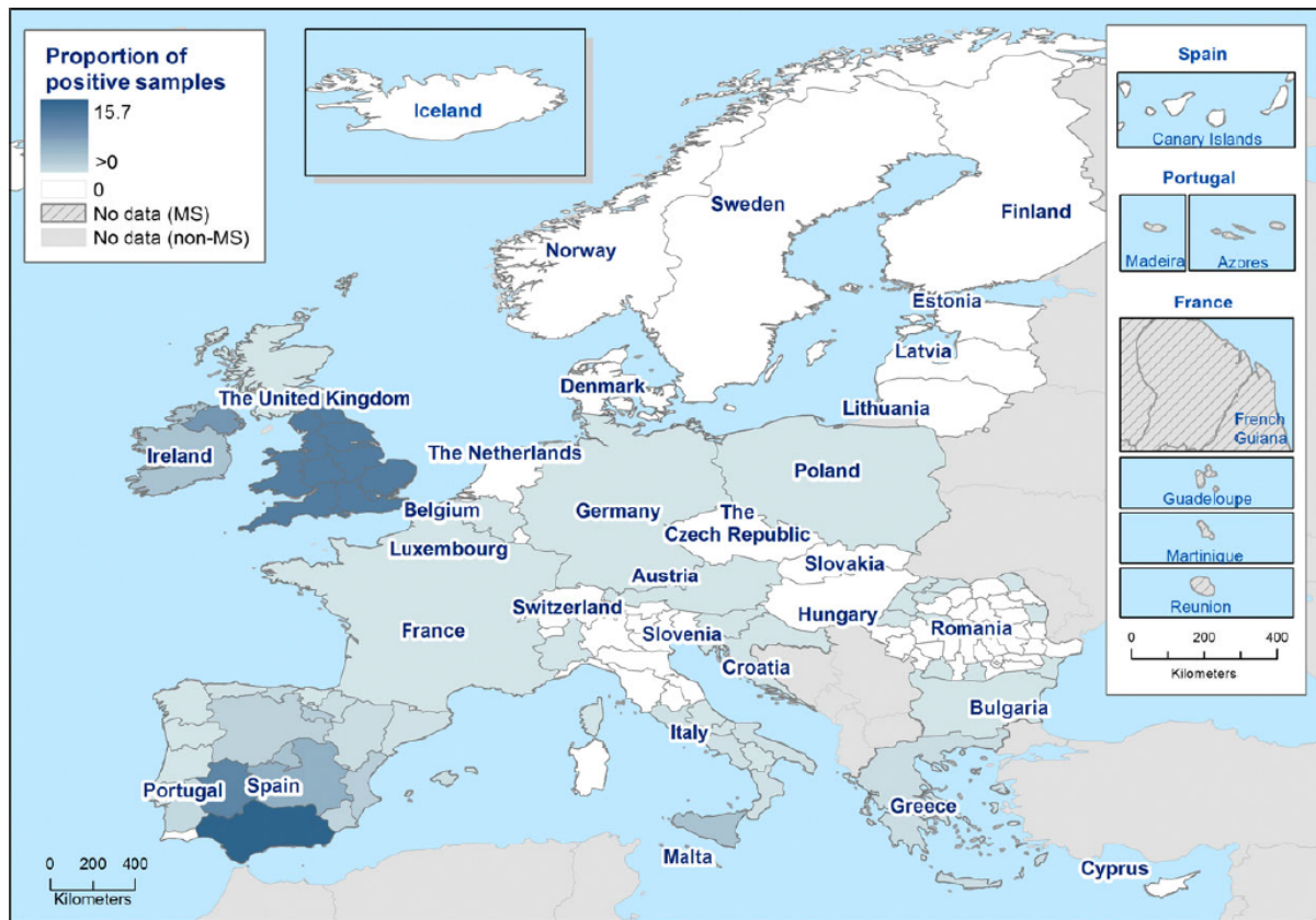
Figure 1: Proportion of cattle herds infected with or positive for bovine tuberculosis in 2015 (from EFSA and ECDC (2016))

Europe with a pronounced spatial clustering. The prevalence ranges from absence of infected animals in most OTF regions to a regional prevalence in non-OTF regions of 15.8% in Andalusia, Spain, considering all herds, or a reported regional prevalence of test-positive cattle herds of 17.7% within the United Kingdom in Wales and England (Figure 1).