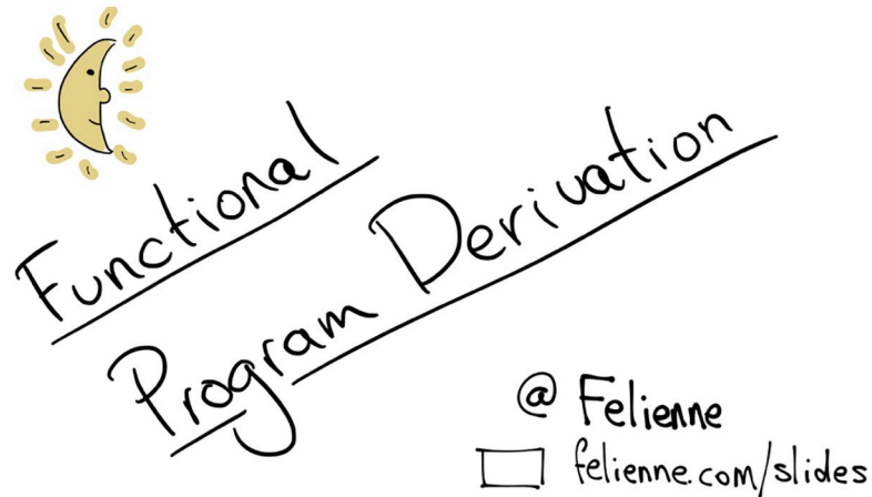
Fig 2. Title slide. Example of adding your Twitter handle to your slides. Source: [17].

https://doi.org/10.1371/journal.pcbi.1007513.g002