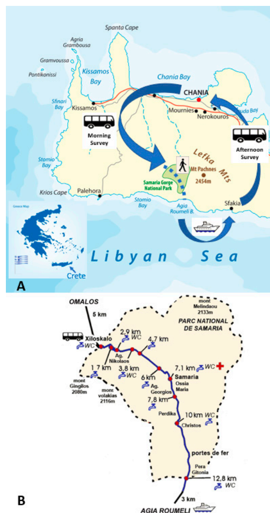
Figure 1. Schematic representation of the day tour and Samaria Gorge walk. (A) is adapted and used with permission from www.depositphotos.com . (B) is adapted and used with permission from Psarakis Travel Agency ( www.psarakistravel.gr ).

Figure 1A schematizes the day tour of the participants. They were picked up at their accommodation between 06:15 and 06:45 in the morning. Participants had booked their day-excursion to the Samaria Gorge either from Chania ( n = 2 excursions), Rethymnon ( n = 4 excursions) or Herakleion ( n = 3 excursions). Depending on their city of residence, they arrived at the Samaria Gorge after a bus drive of approximately 2 to 3 h: Chania (08:35), Rethymnon (09:00) or Herakleion (09:15). From Hora Sfakia, all busses returned to the participants’ accommodations in the afternoon at 18:00. Figure 1B shows the several resting locations where participants could drink water during the walk. These are simple tap points, as there are no inhabited villages or stores from which to buy refreshments in the Samaria Gorge.