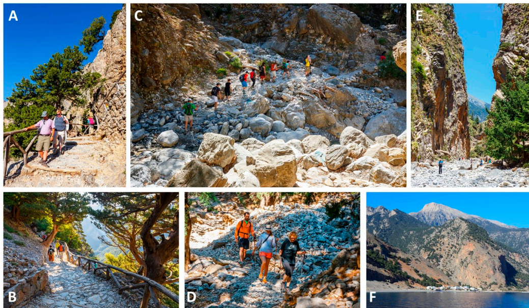
Figure 2. Impressions of the Samaria Gorge walk. (A,B) Over the first kilometers, participants descend a narrow switchback path, which is partly bordered by a wooden handrail. A large part of the walk is through rough terrain, i.e., the slippery stones of a dried-up riverbed. In winter, the riverbed is filled with water, but in summer the river has mostly dried up. Participants cross the riverbed several times, sometimes aided by wooden improvised bridges. (C,D) there is no paved road but participants have to follow a trail through a rocky valley. Samaria is the main resting place for most participants, as this uninhabited tiny village contains benches in the shade, a water tap point and a medical post. Through the last part of the walk, the cliffs become higher and narrower. (E) At its narrowest point, called the “Gates”, the Samaria Gorge is approximately 4 m wide, while the cliffs rise over 300 m high. (F) Thereafter, the final fairly flat part of the walk ends in Agia Roumeli at the seaside. Participants can relax, eat and drink in the taverns, and recover from the walk. From Agia Roumeli, a ferry brings the participants to Hora Sfakia in about 1 h. From there, coaches leave at 18:00 to bring the participants back to their accommodation.

The Samaria Gorge walk is 15.8 km long. It starts in Xiloskalo at an altitude of 1230 m and ends in Agia Roumeli, a small village at the Libyan Sea. Agia Roumeli can only be reached by walking the Samaria Gorge or by boat. The actual walk through the Samaria Gorge is about 12.8 km long, and after the end of the gorge, it takes another 3 km of walking to reach Agia Roumeli. Hence, participants walk 15.8 km in total, starting at an altitude of 1230 m, slowly descending to sea level in Agia Roumeli. The first part of the walk is 3.8 km long with a 580 m descent, followed by 3.7 km with a 310 m descent. Thereafter, the decent is less steep (3.6 km with a decent of 170 m). The last 4.7 km has a decent of 170 m towards sea level. An impression of the Samaria Gorge walk is given in Figure 2.