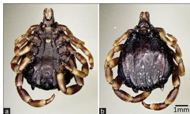
Figure-2: Camel tick Hyalomma dromedarii (Acari: Ixodidae) adult male: (a) Ventral and (b) dorsal.

Ticks were found on different body parts (Figure-3). The body regions of camels differed in terms of prevalence, mean intensity, and mean abundance of ticks. The tail area had the highest prevalence (95%), mean intensity (6.25 ticks/infected host), and mean abundance of ticks (5.92 ticks/host, Table-2). The abdomen was the second most heavily infested region although this was not significantly lower than the tail (Table-2). All other regions were less infested with ticks in terms of prevalence, mean intensity, and mean abundance (all pairwise comparisons were not significant), with one exception. The forelegs had