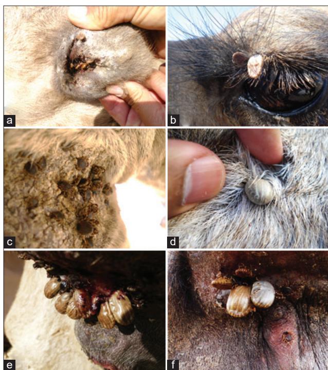
Figure-3: Hyalomma dromedarii ticks on different body parts of the camel: (a) Ear, (b) upper eyelid, (c) leg, (d) abdomen, and (e and f) tail area.