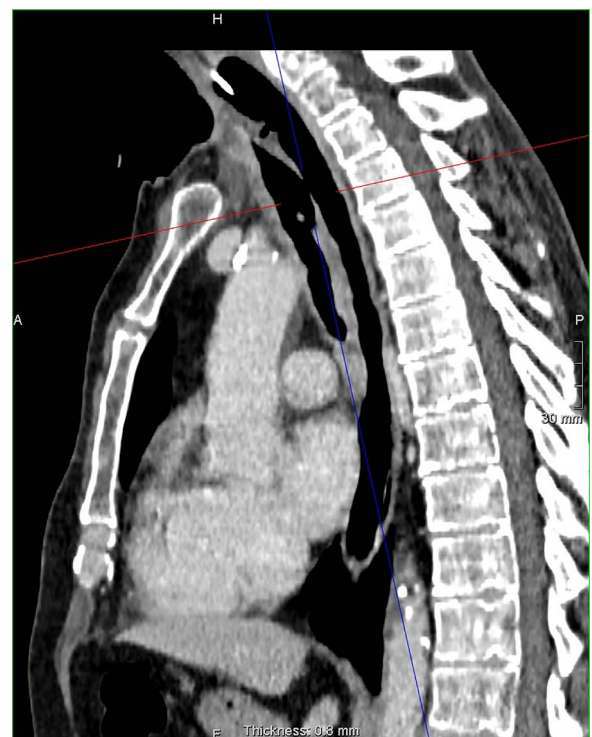
Figure 3: Sagittal reconstruction post contrast CT neck and thorax images with 4 mm defect/tracheoesophageal fistula located 8–9 cm from tracheostomy level and 12 cm proximal to the carina.