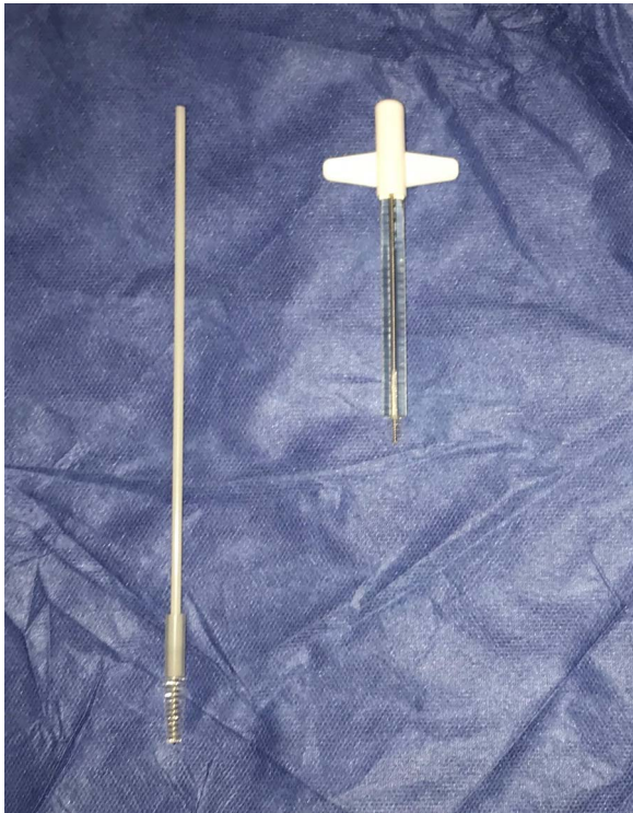
Figure 1: Image demonstrating on the left the insight voice prosthesis brush and on the right the Blom-Singer voice prosthesis brush.

As per the manufacturing guidelines, the brush should be used once a day only to clean the speech valve, but not to clear mucous secretions inside the trachea. After 1 month's usage, a brush should be replaced. However, the patient went against the medical advice and used the brush vigorously several times a day to clean tracheal mucous secretions. As a result, he had mislaid voice prosthesis brushes numerous times in his bronchi or carina, which had to be removed by bronchoscopy.