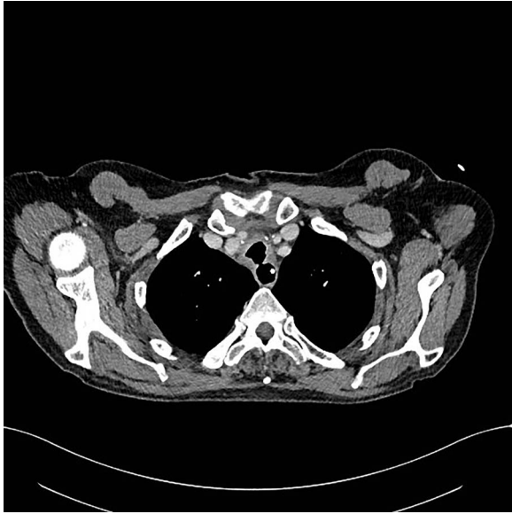
Figure 4: Axial reconstruction post contrast CT neck and thorax images with 4 mm defect/tracheoesophageal fistula located 8-9 cm from tracheostomy level and 12 cm proximal to the carina.

first reported case of a life-threatening complication resulting from inappropriate, chronic use of speech valve brushes. Voice prostheses are common mechanical aids advised to patients who have undergone tracheostomy or laryngectomy [7]. Regular cleaning of speech valve with a valve cleaning brush as per the recommended guidelines is essential. However, obsessive and inappropriate use of the valve cleaning brushes inside the trachea can have adverse effects as minor as mislaying speech valve brushes and as severe as TOF.