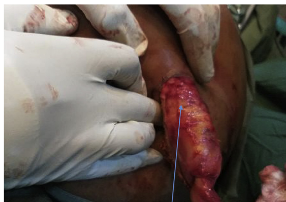
Gallbladder retrieval from the supra-umbilical port