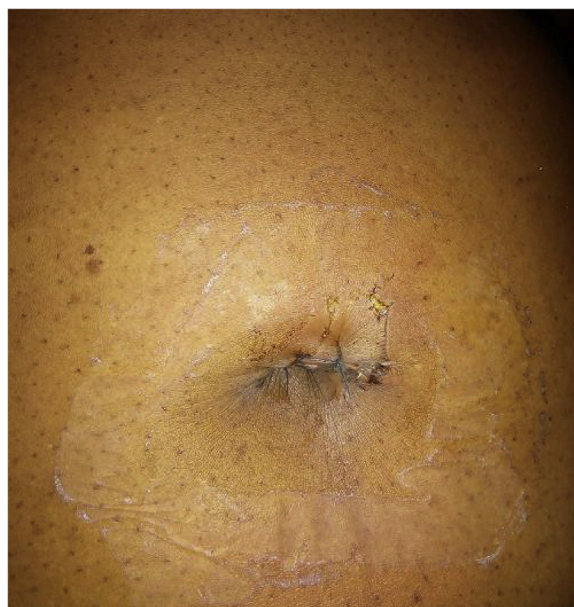
Fig. 7. Widened Supra-umbilical port at post-operative day three.

retrieval of gallbladder was done through the supra-umbilical port (Figs. 4 and 5). Intra-operative findings were multiple calculi with one of the stones measuring 8 cm by 6 cm in widest diameters (Fig. 6). Her 3rd day Post-operative wound scar show normal healing (Fig. 7). Her follow-up in outpatient clinic was uneventful.