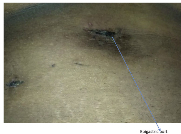
Fig. 1. Post-operative day 3 of widened epigastric port.

She had laparoscopic cholecystectomy. Fig. 1 at post-operative day 3. The findings were: Giant gall bladder calculus measuring 8.2 cm by 7.5 cm in diameter (Fig. 2). Her 7th day Post-operative wound showed normal healing (Fig. 3). Histology report showed acute cholecystitis from cholelithiasis.