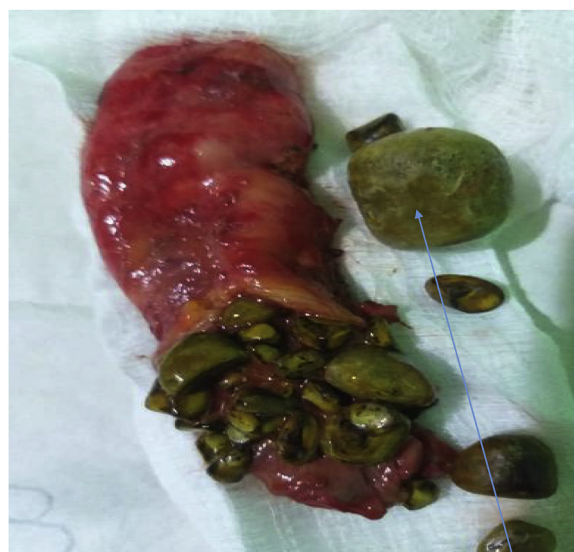
Giant Gall Stone