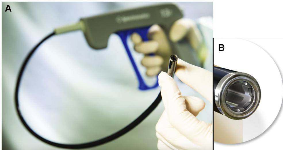
Figure 2 TightRail mechanical dilator sheath (Spectranetics Corp, Colorado Springs, CO) components illustrated. A: Flexible inner sheath, proximal handheld drive mechanism. B: Dilating metal blade at distal tip.