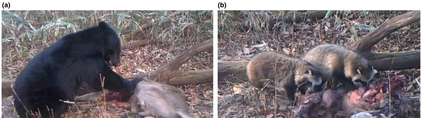
FIGURE 1 Images (from video recordings) of our most frequent scavenger species (a) Asian black bear and (b) raccoon dogs scavenging on the same sika deer carcass in 8 November 2016

test (Sokal & Rohlf, 2012). We then tested for differences in the feeding durations among scavenger species to see if some species scavenged for longer durations than others. We modeled the mean feeding time of all species using a generalized linear model (GLM) with a Gamma distribution. We added 10^{-4} to all of the zero values of the total feeding times (i.e., instances where a species visited a carcass but did not scavenge) to ensure a fit of the Gamma distribution. We used the total feeding times at carcasses as our dependent variable and used the scavenger species as the independent variables. We performed post hoc pairwise comparisons with Tukey's HSD test (Sokal & Rohlf, 2012) using the multcomp package (Hothorn, Bretz, & Westfall, 2008) between each species pair (i.e., 36 comparisons) to determine where significant differences occurred.