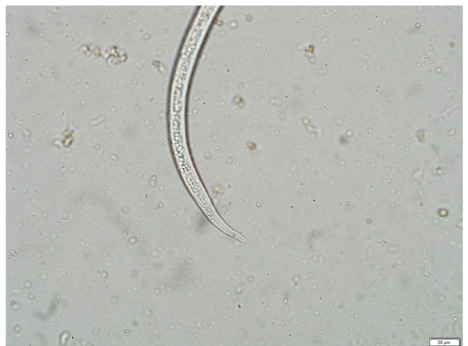
Fig. 2. a) Dictyocaulus arnfieldi first-stage larvae showing typical granular appearance and beginning of cuticular separation b) closer view of tail showing stylet, or spear.

exception that larvae in Baermann sediments were heat-killed, fixed in 10% neutral-buffered formalin, and counted at ZPRU.