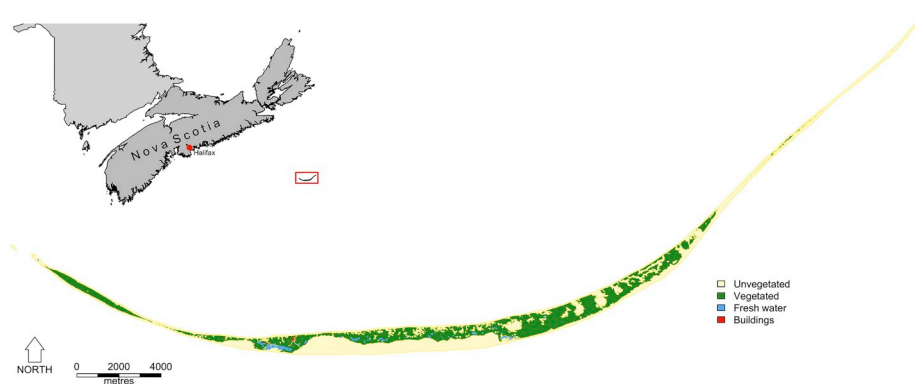
Fig. 1. Map of Sable Island, Canada, which is about 50 km long, 1 km wide at its widest point, and in total, 34 km 2 (from Gold et al., 2019).

been legally protected from human interference since 1961, and Sable Island became a National Park Reserve in 2013, with the horses now classified as ‘naturalized wildlife’. The population is free-ranging, and the horses survive despite high pasture densities, a high component of sand in their diet, and absence of human interventions such as supplementary feeding, anthelmintic treatment, dentistry, and farriery. To our knowledge, Sable Island supports one of few feral horse populations where no members have received anthelmintics, the population is closed, and individual animals are identifiable from a photographic database dating back to 2007. Genetic analyses of the Sable horses suggests that they are unique, highly inbred, and share a common ancestor with Newfoundland, Icelandic and Fjord breeds (Plante et al., 2007; Tollett, 2018). As such, they represent a study system of great scientific and veterinary interest, and are equally important from a conservation perspective.