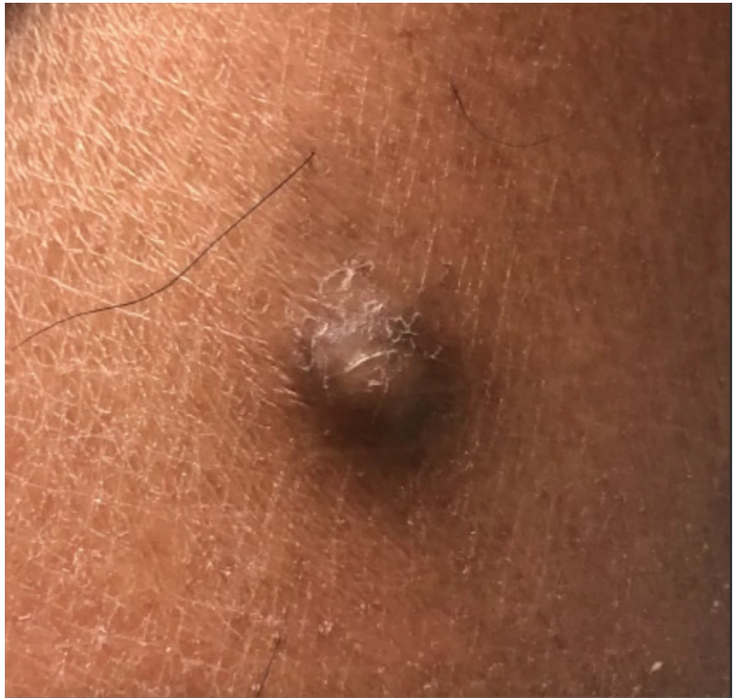
FIGURE 1: Photograph of cystic lesion, as seen during the latest consultation.

The patient is otherwise healthy and has reported no fevers, chills, nausea, or vomiting. As a medical student in Antigua with decreased access to medical care, he decided to seek surgical intervention due to recent mild discomfort.