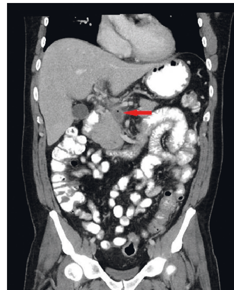
FIGURE 3: Computed tomography (CT) abdomen was repeated which showed resolution of the portal vein gas but showed interval development of portal vein thrombosis and proximal superior mesenteric vein.