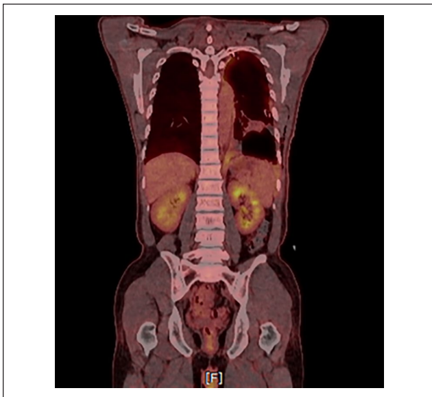
Figure 2. Positron emission tomography/computed tomography scan of the patient with increased FDG uptake showing thickening of the left pleura with pleural effusion in December 2017.

A 49-year-old man, who worked at an automobile factory and was exposed to chemicals on an intermittent basis, presented with left chest pain and dyspnea. A computed tomography (CT) scan in June 2017 showed diffuse