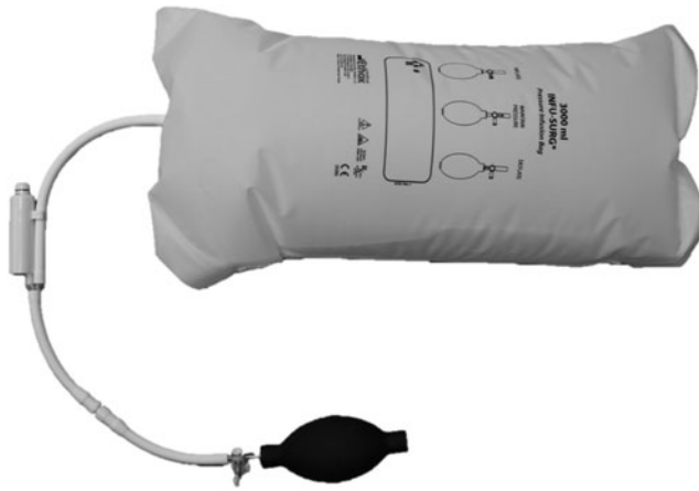
FIG. 2. Hand pump infusion system (Infu-Surg® Pressure Infusion Bag; SunMed/Ethox).

about flow or requests to increase irrigation pressure). After completion of the case, the primary operating surgeon and the primary circulating nurse assigned to irrigation pump maintenance recorded his/her satisfaction with the irrigation system (1 = highly dissatisfied to 10 = highly satisfied). Surveys were completed by 6 urologic surgeons and 28 nurses. During PCNL, irrigation-related concerns and satisfaction scores pertaining only to use of the nephroscope were recorded.