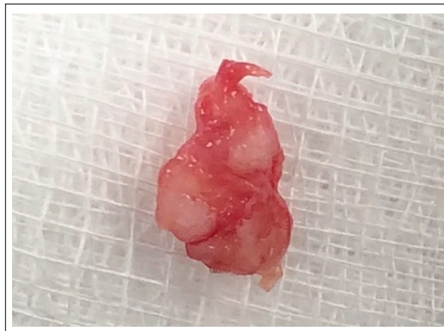
Figure 2 Photograph of the resected fragmented sesamoid

puncture wound on the palmar aspect of the distal metacarpal region. Radiographs were performed of the right and left manus; however, no abnormalities were identified. The lameness was initially managed with a 4-week course of meloxicam (0.05 mg/kg q24h PO) and a one-off injection of cefovecin (8 mg/kg SC), in conjunction with restricted exercise. There was minimal improvement noted over the 4 weeks prior to referral.