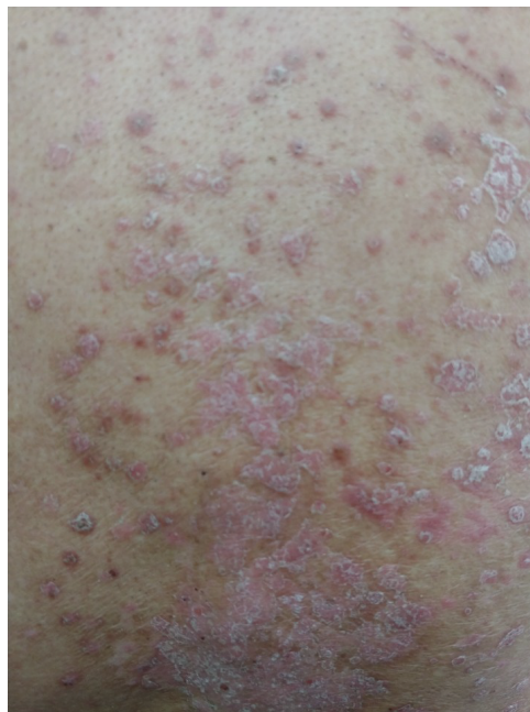
Figure 3. Exacerbation of psoriasis under immune checkpoint inhibitors; plaque psoriasis with silvery scales on trunk.

In most cases, dermatologic toxicity is mild and can be treated with topical corticosteroids or antihistamines (grade 1) (83). Gabapentin, a neurokinin 1 receptor antagonist, and doxepin