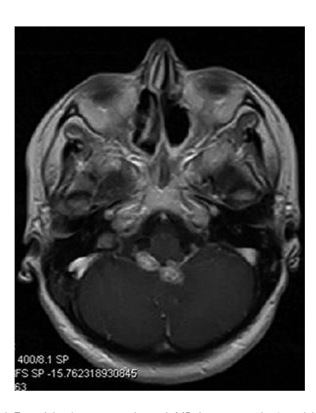
Fig 1. Axial T1-weighted contrast-enhanced MR image reveals 2 nodular-enhancing extra-axial lesions on the posterior wall of the fourth ventricle, which appears to be slightly dilated. The diameter of the largest lesion is 13 mm; in addition, there is linear meningeal enhancement close to the lesions.