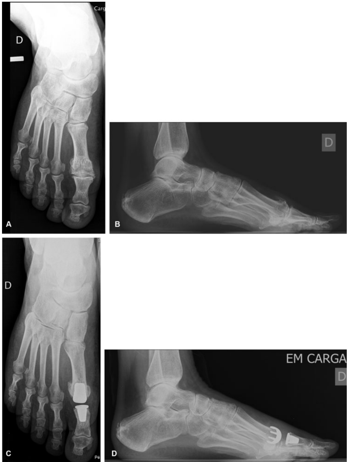
Fig. 3 Pre- and postoperative X-ray images of a 62 year old man with hallux rigidus submitted to arthrodesis with crossed-screws. (A) Preoperative standing anteroposterior X-ray; (B) Preoperative standing lateral X-ray; (C) Postoperative standing AP X-ray 2 years after surgery; (D) Postoperative standing lateral X-ray 2 years after surgery.