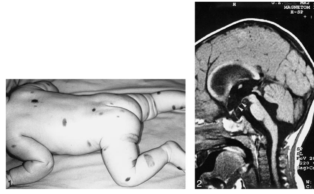
Fig 1. Multiple congenital hairy nevi are seen on a 6-month-old.