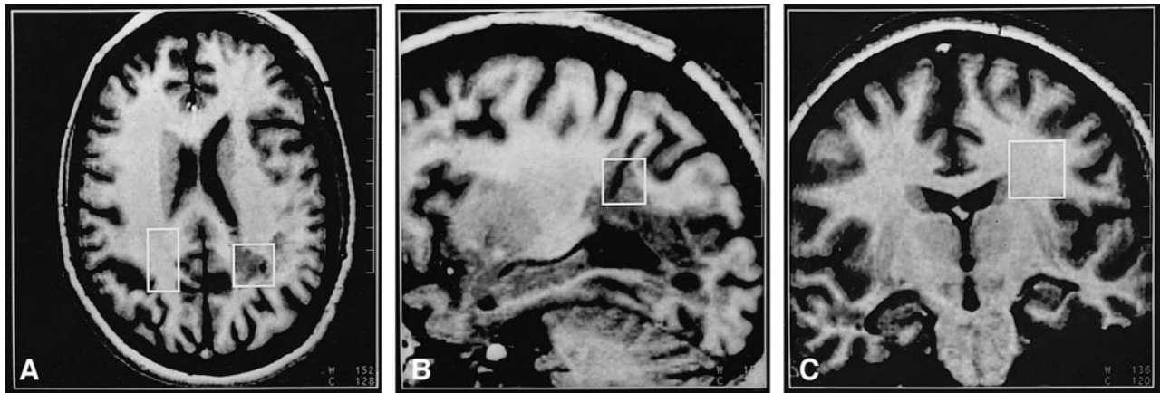
FIG 2. T1-weighted gradient-echo MR images (3D fast low-angle shot, 4-mm partitions, 15/6 TR/TE, 20° flip angle) of patient 1 indicating VOIs selected for MRS.

A, Transverse section with VOIs centered at the left parieto-occipital lesion ( 20 \times 20 \times 20 \text{ mm}^3 ) and in a contralateral control region ( 16 \times 30 \times 16 \text{ mm}^3 ).