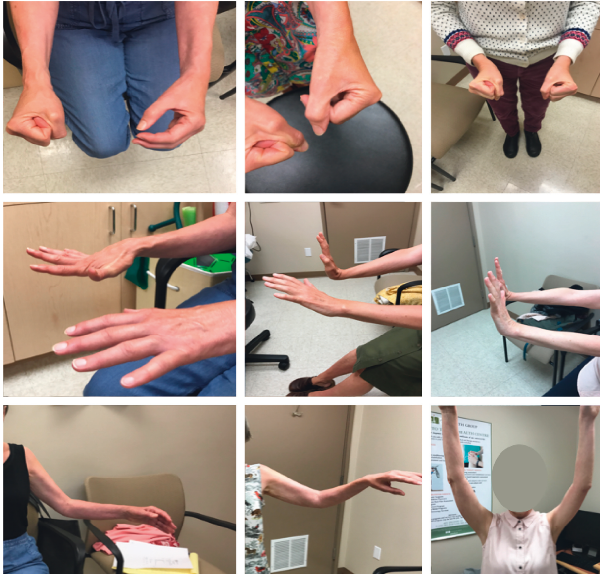
FIGURE 5: Complex regional pain syndrome after elbow dislocation. Initial presentation is shown in the first column. The patient no longer met Budapest criteria at 4 weeks on prednisone, with functionally but not fully restored range of motion (second column). However, the patient continued to recover after completion of treatment (third column).

patients with longstanding CRPS did not respond to prednisolone [14]. The median CRPS duration before treatment was 15 months, which is far greater than our studied population. Results from all these studies hint towards the importance of time to treatment and underscore the importance of early recognition of CRPS before entering a chronic phase.