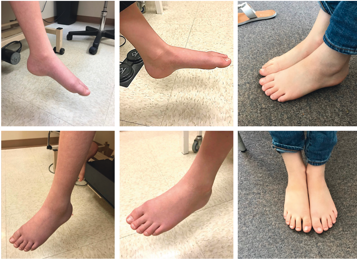
FIGURE 6: Idiopathic left leg complex regional pain syndrome in adolescent female. Left images were taken before prednisone treatment, middle images were taken at two weeks of treatment, and right images were taken at two months after starting treatment. The patient made a full recovery.