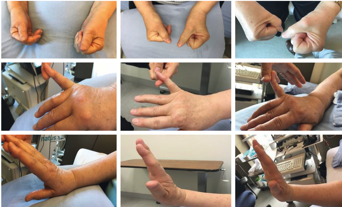
FIGURE 3: Complex regional pain syndrome type II due to carpal tunnel syndrome with multiple joint ranges affected. There is progression from before prednisone treatment (left images) to two weeks of treatment (middle images) to completion of four-week course of prednisone (right images).