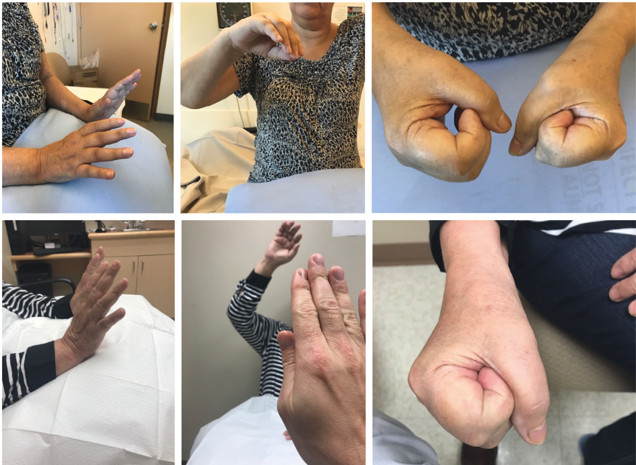
FIGURE 4: Complex regional pain syndrome after right humerus fracture with involvement of the shoulder, elbow, wrist, and fingers presenting with pain and decreased range of motion. Top images were before treatment, and bottom images were after 4-week course of prednisone.