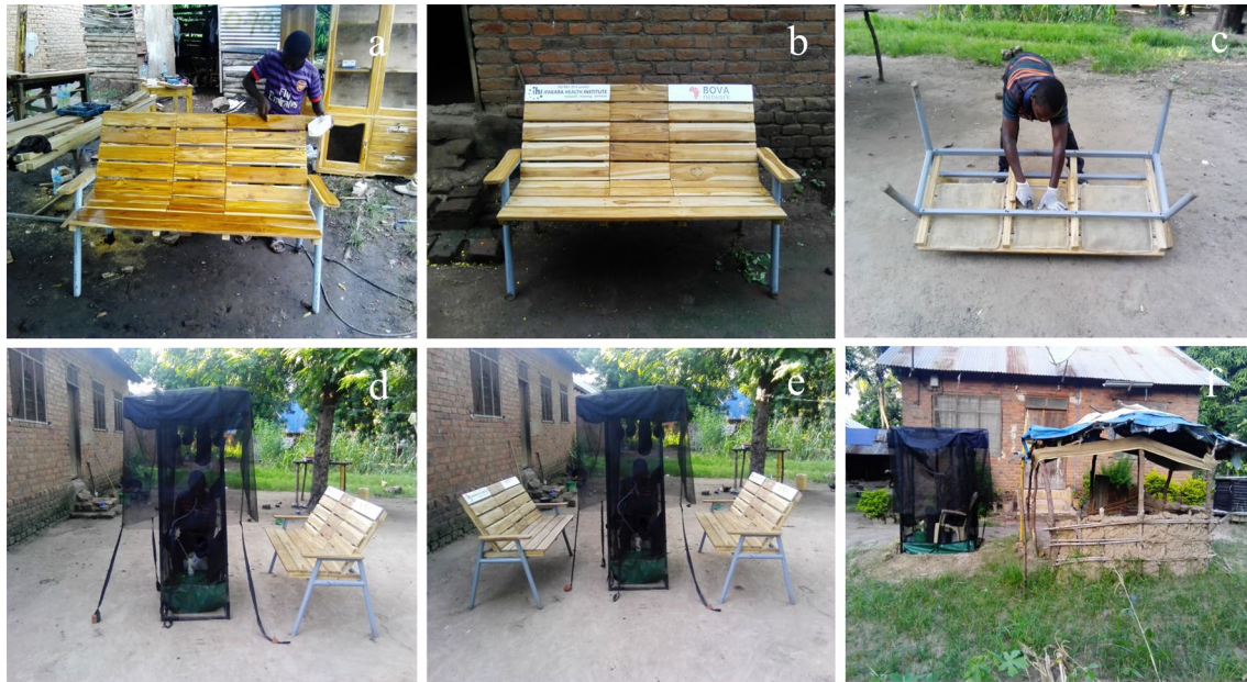
Fig. 2 Design and prototyping of the wooden chairs at the local carpentry (a), overview of the prototyped chair (b), fitting transfluthrin-treated hessian mat underneath the chair (c), one transfluthrin-treated chair with the DN-Mini trap positioned 0.5 m (d), two transfluthrin-treated chairs with DN-Mini trap installed 0.5 m (e); and outdoor kitchen fitted with transfluthrin-treated sisal ribbon with DM-Mini trap positioned 1.2 m (f)

part of the chair (Fig. 2c). These mats were made by a local seamstress at the Ifakara Health Institute fabrication facility (the MozzieHouse). The hessian mats had been treated in emulsified solutions containing 2% transfluthrin (Bayer AG, Germany), prepared as previously described [31, 33].