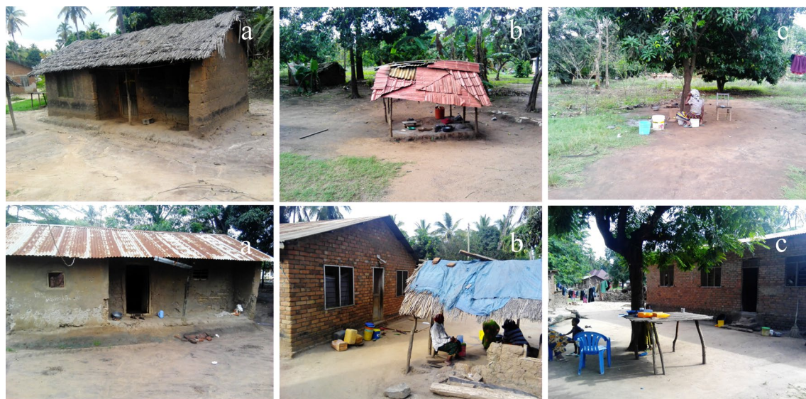
Fig. 3 Illustration of houses with veranda extension physically characterized during survey (a), houses with built-up peridomestic space away from the main house commonly used for cooking (b) and houses with non-built-up peridomestic space physically characterized as under the tree (c)

Findings on protective efficacy of the two interventions are summarized in Tables 3 and 4. Using two transfluthrin-treated chairs significantly reduced outdoor-biting An. arabiensis mosquitoes by 76% (Relative rate (RR)=0.24, 95% confidence interval, CI 0.19–0.29, P<0.001 ) and by 85% (RR=0.15, 95% CI 0.12–0.18, P<0.001 ) in dry and wet seasons, respectively. Using one transfluthrin-treated chair also significantly reduced An. arabiensis mosquitoes, in this case by 70% (RR=0.30, 95% CI 0.25–0.37, P<0.001 ) and by 75% (RR=0.25, 95% CI 0.20–0.31, P<0.001 ) in dry and wet seasons. When the densities of Culex mosquitoes were assessed, both the two-chair and one-chair interventions significantly reduced outdoor-biting, achieving 52% (RR=0.48, CI 0.37–0.63, P<0.001 ) and 58% (RR=0.42, 95% CI 0.31–0.56, P<0.001 ) protection, in dry and wet seasons, respectively. In the wet season, both the two-chair and one-chair interventions significantly reduced outdoor-biting, achieving 51% (RR=0.49, CI 0.43–0.56, P<0.001 )