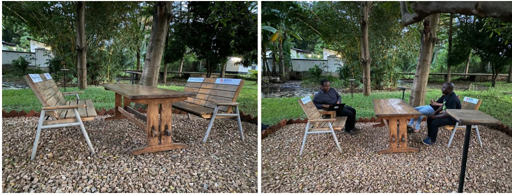
Fig. 4 Picture of the first mosquito-free zone established at Ifakara Health Institute in January 2020. The chairs have transfluthrin-treated hessian mats underneath, but are layered with plastic sheeting to prevent rainfall and user contact

transfluthrin-treated coils could protect non-users within 20 m radius. More recently, Mwangi et al. demonstrated that transfluthrin-treated ribbons fitted to the eave gaps of houses protected volunteers both inside and outside the houses [37].