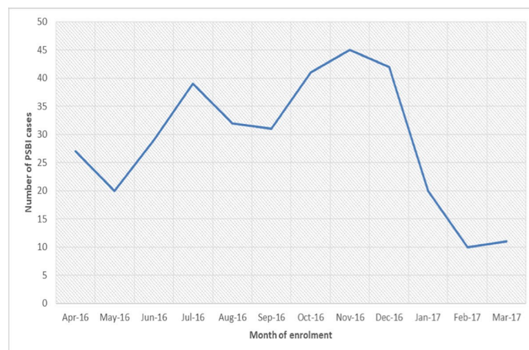
Fig 4. Identification of PSBI cases at the PHCs by month.

CORPs identified and referred 88.8% (308/347) of the sick young infants who were classified to have PSBI at the PHCs. Nearly all (97.4%, 262/269) families whose young infants were referred to a hospital from a PHC refused to take their infant to the hospital. Therefore, these infants were treated on an outpatient basis. This included 10 families whose young infants had signs of critical illness but they did not want to go to a hospital despite extensive counselling by the PHC staff (Table 2).