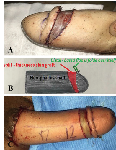
Fig. 3: A: Final view of new technique. B: Schematic view of Norfolk technique. C: Final view of Norfolk technique.

At 6-month postoperative follow-up, there was one patient with score 1 (unacceptable) in Norfolk group, whereas such case was not reported in new technique group. On the other hand, there were 5 and 3 patients who scored