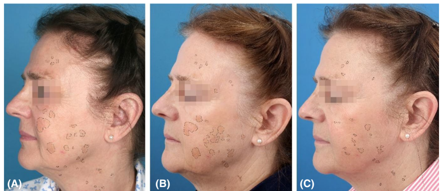
FIGURE 1 Standardized pictures obtained using a Visia camera system (Candfield); before the Kleresca® pre-post treatment (A), 1 wk after the second Kleresca® session and immediately prior to the treatment with the QS-ruby laser (B), and 3 wk after the QS-ruby laser treatment (C) were used to track the changes in pigmentation. (D) Graph shows the % area of pigmentation identified from the patient pictures [Colour figure can be viewed at wileyonlinelibrary.com ]

Here, we present a 67-year-old woman with histologically confirmed SL (Figure 1A) treated with the Kleresca® treatment (FB Dermatology, Ireland). Treatment comprised the application of a 2-mm layer of the Kleresca® pre-post photoconverter gel followed by irradiation with a multi-LED lamp (447 nm), as per the instructions for use. A double/stacking treatment consisting of one 9-minute treatment session, a 10-minute interval, and a subsequent 9-minute treatment session was completed once a week for 2 weeks. One week after the second Kleresca® treatment session, the patient was treated with a 694 nm Qs-ruby laser using a 4-mm spot with