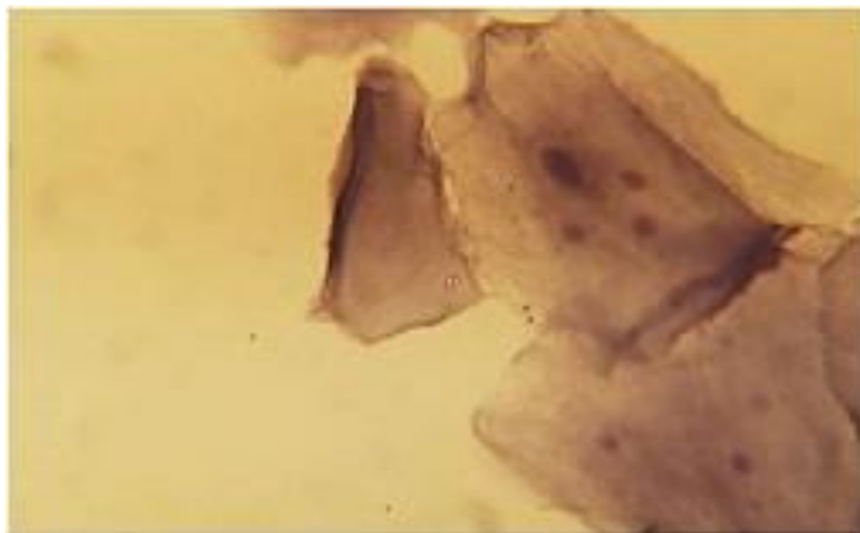
Fig. 1. Photomicrograph of a cell with 3 micronuclei (arrows) in buccal mucosa smear of waterpipe smoker ( \times 1000 , Feulgen staining)