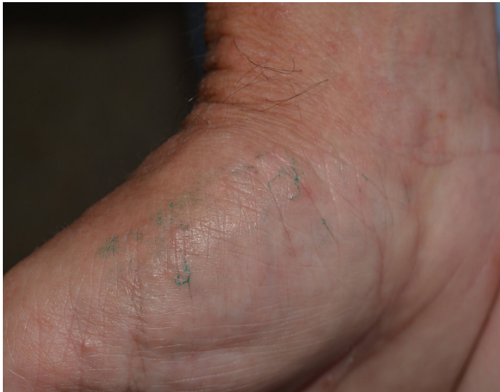
Figure 2. Scabies burrow ink test. 50

the emergency department, this is a simple test that may help diagnose scabies.