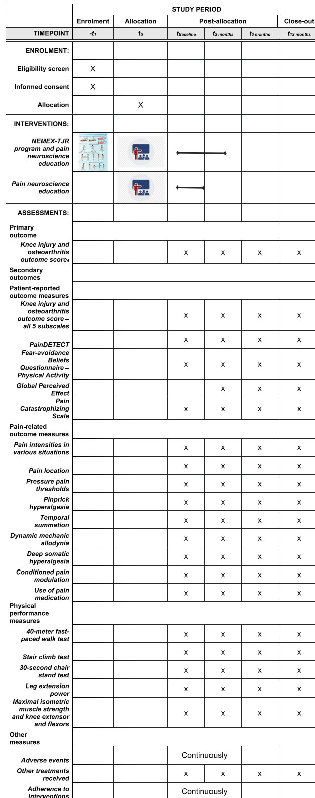
Fig. 2 SPIRIT figure showing schedule of enrolment, interventions, and trial outcomes to be assessed