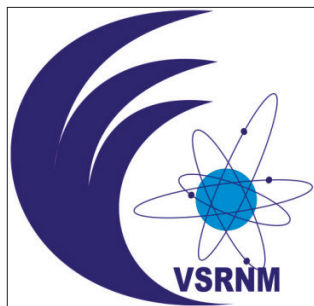
Figure 3. Logo of Vietnamese society of radiology and nuclear medicine.