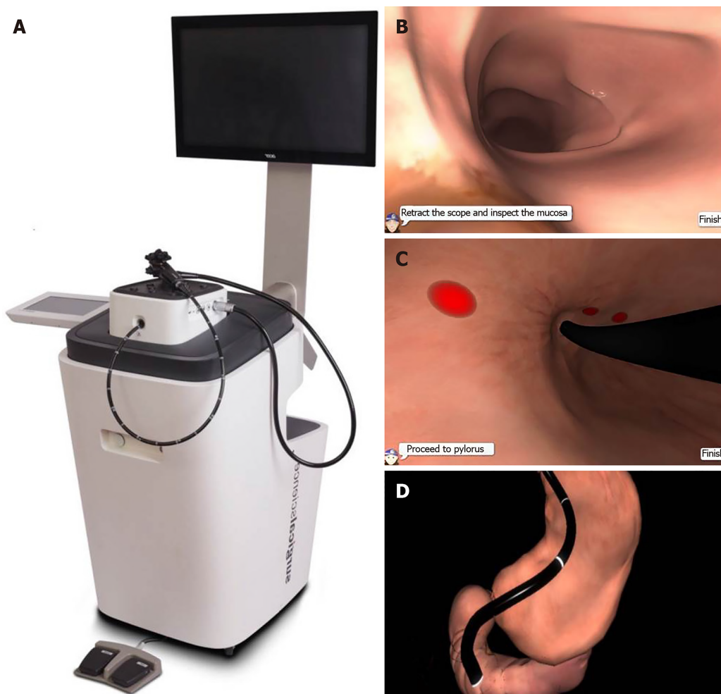
Figure 1 The surgical science EndoSim simulation module. A: Endoscopy stack; B: Virtual reality views of the duodenum; C: Gastric cardia; D: Endoscope configuration.

evaluated over the 200 post-SPRINT procedures using generalised estimating equation (GEE) models, to account for the non-independence of repeated procedures by the same trainee. Prior to the analysis, the relationship between procedural experience and outcome measures were assessed graphically, and transformations applied, as applicable, to ensure goodness-of-fit. Binary logistic GEE models were then produced, using an autoregressive correlation structure. The trainee group (case/control) and the procedure number post-SPRINT were set as covariates, with an interaction term also included in the model. As such, the analysis allowed for the two groups to have different outcome rates at baseline, but also allowed for the rate of improvement over time to vary between the groups, with the interaction term allowing for comparison of the latter.