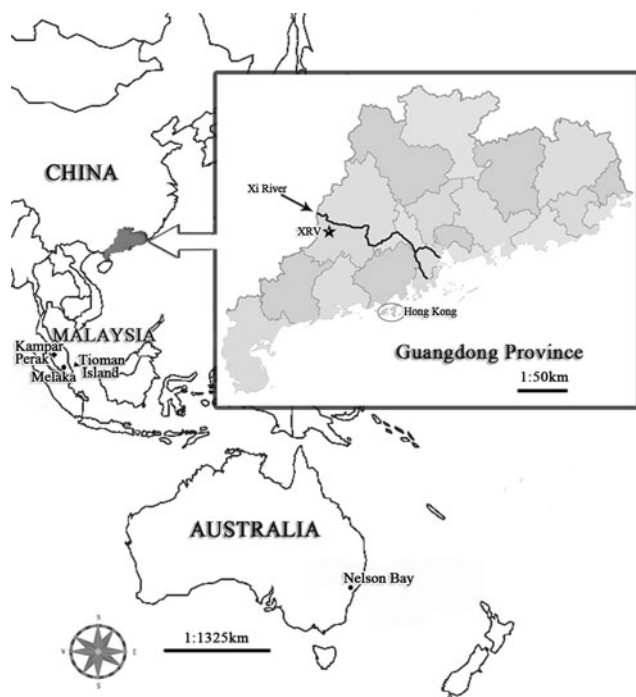
Fig. 1 Global distribution of bat-origin reoviruses. The locations of viral sample collection are indicated. The magnified map on the right shows the location of the XRV sample collection near the Xi river of Guangdong province, China

Here, we report the first isolation and characterization of a bat reovirus in China to support the claim that this virus is a new member of the NBV species. In this study, lung specimens of 150 fruit bats Rousettus leschenaultia were collected from a location near the Xi River of Guangdong province, China (Fig. 1). Equal amounts of lung tissue from five bats were pooled, and each pooled sample was homogenized in minimum essential medium (MEM) supplemented with antibiotics and clarified by centrifugation. Supernatants were inoculated onto conventional monolayer cultures of Vero-E6 cells in MEM supplemented with 5% newborn calf serum (Hyclone, Logan, UT) and antibiotics and incubated at 37°C in 5% CO 2 . The cultures were